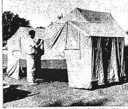
which has the trailer attached, in preparation for a weekend outing. Above, right, the camp looks as it will be when the Price family reaches its favorite spot. The four-bedroom unit has, on occasion, accommodated 11 sleepers and 12 under and outside gear.